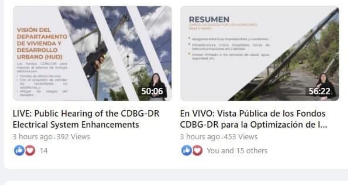
Figure 1 Screen captures from PRDOH CDBG-DR Facebook page