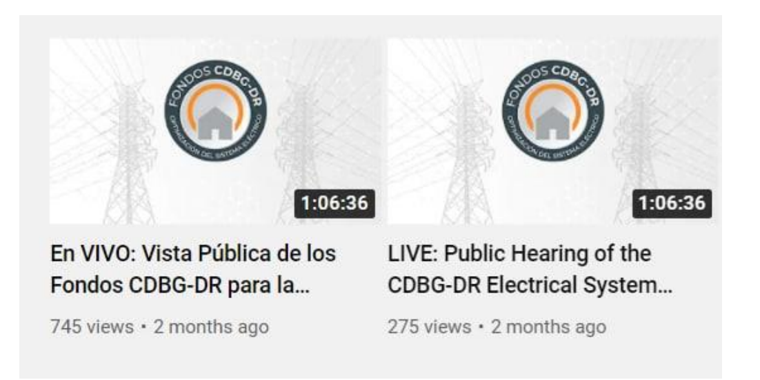
Figure 3 Capture from the CDBG-DR YouTube page – views from the second public hearing as of January 20, 2022.

Figure 2 Capture from the CDBG-DR Facebook page - views from the second public hearing as of January 20, 2022.